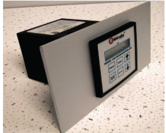
FW Murphy S1501

For more information, contact your local representative today!